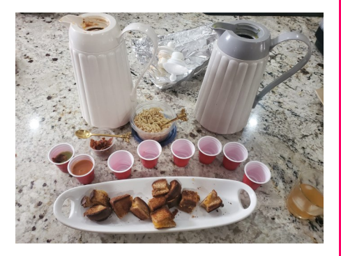
Soup Shots: Tomato soup with grilled cheese bites & Pea soup with roast prosciutto crumbles by Barbara