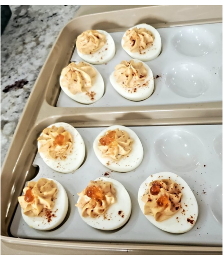
Salmon Deviled Eggs by Donna