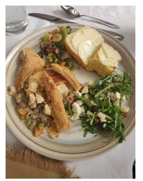
Cape Cod salad by Diane