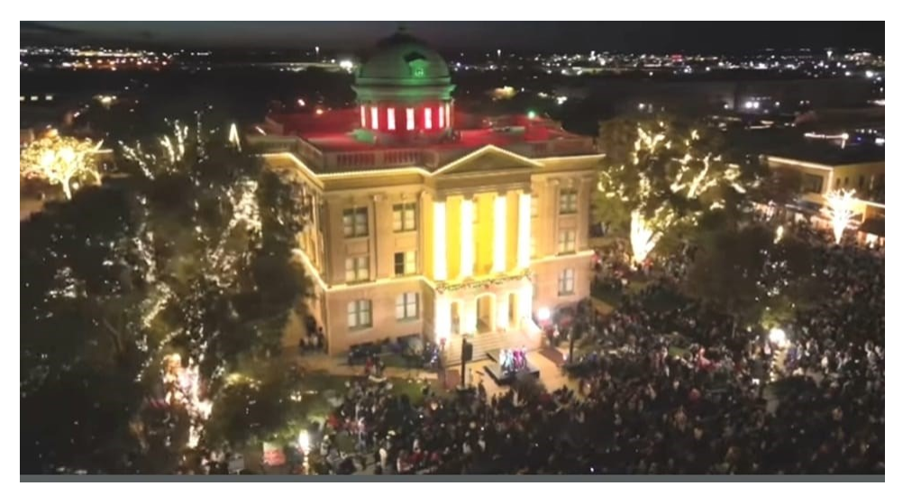
Georgetown Newcomers and Friends