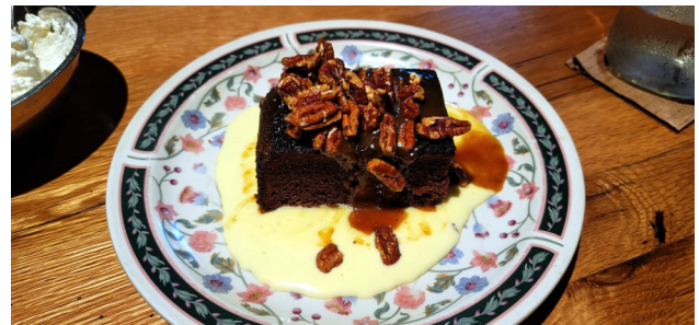
The famous Whiskey Cake—so yummy!