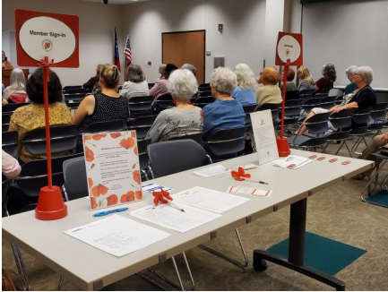
Nice new signs to welcome attendees