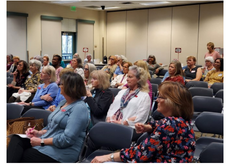
40+ in attendance