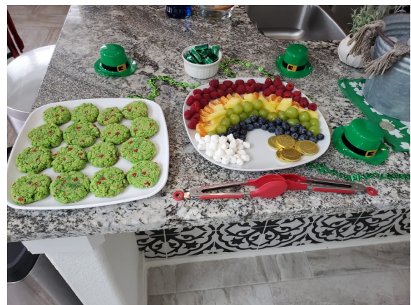
Celebrating St. Patrick's Day with Mahjong, good food, good friends, lots of fun—and Pot of Gold mimosas!