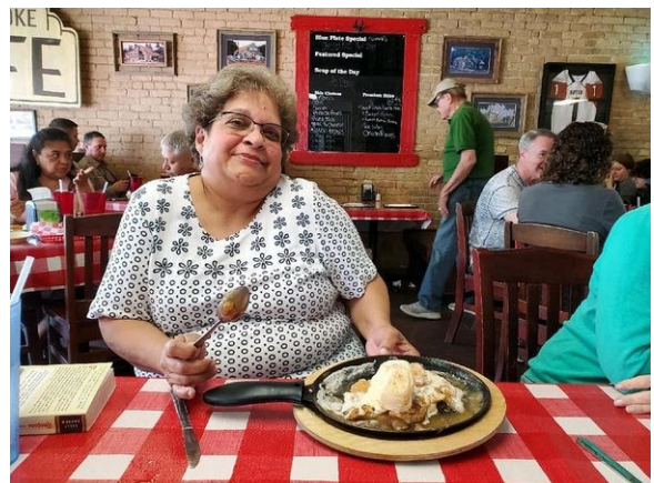
At The Texan Café & Pie Shop—Hutto