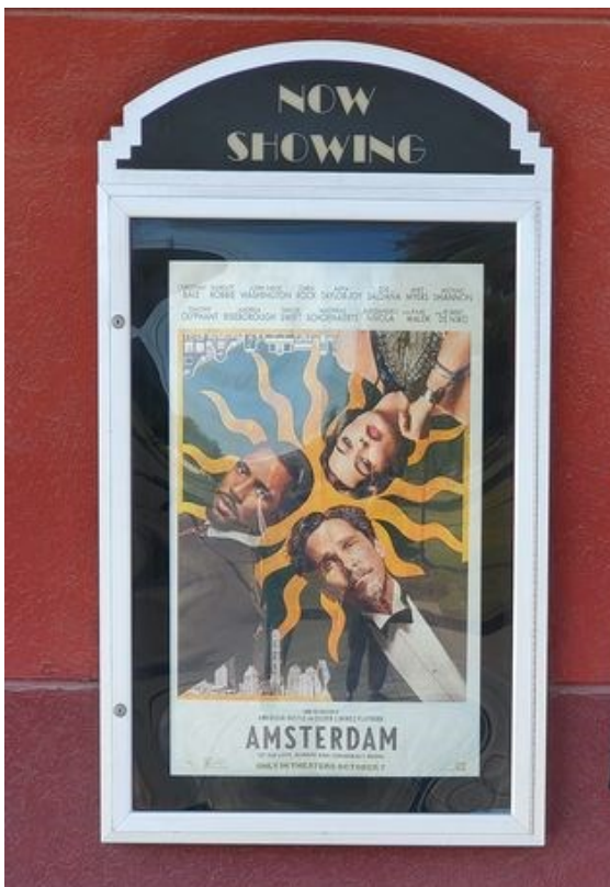
City Lights—Georgetown 2020 Scratch Kitchen