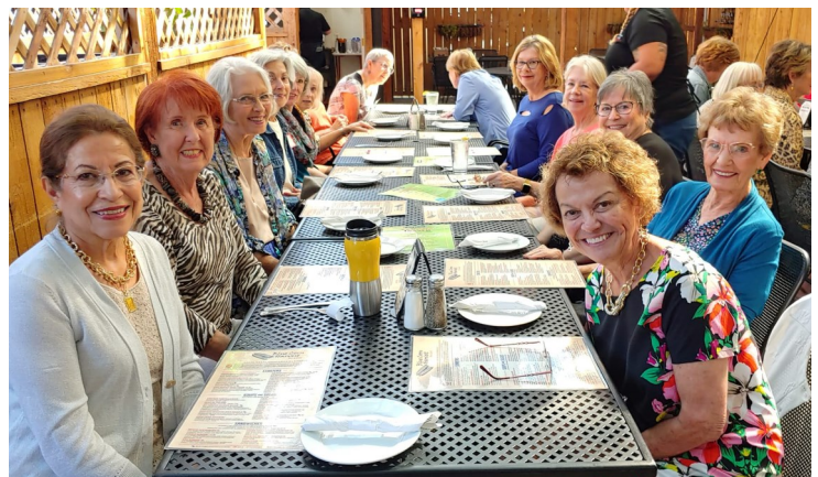
Lunch at Blue Corn Harvest after the meeting