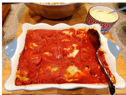
Cabbage rolls by Chee