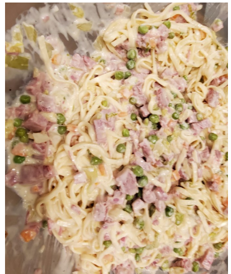
Corned beef Alfredo by Chee